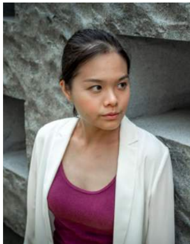
Download high resolution image here .