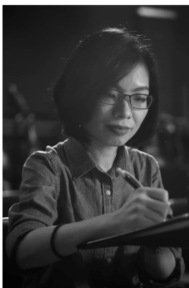
Download high resolution image here .