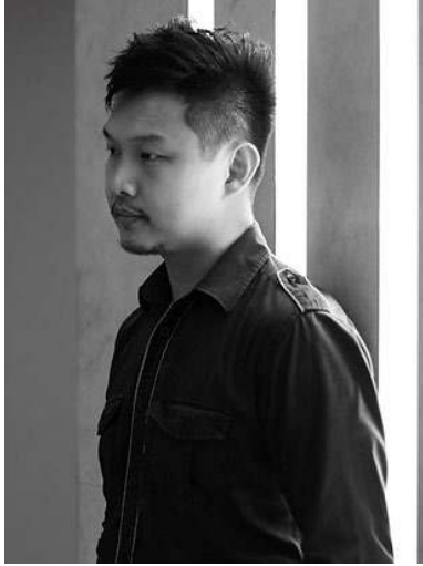
Download high resolution image here .