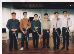
Hunix Bowed-String Ensemble 执竹者弓弦乐团

For more information, please visit 欲了解更多信息, 请访问 www.esplanade.com/dingyi