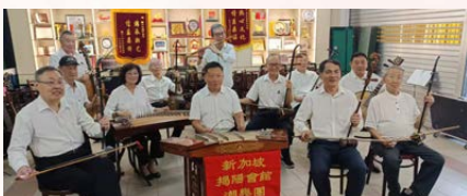
Singapore Teochew Ensemble 揭阳会馆潮乐团

2024年鼎艺华乐室内乐节将由来自香港的竹韵小集开启, 以生动的广东音乐演绎和精湛的表演技艺, 带来一场弦歌不断、粤韵飞扬的音乐会。音乐节总监叶聪以及副总监黄德励也将带领鼎艺团, 携手驻节艺术家杨雪, 在此音乐会中亮相, 与竹韵小集进行交流, 以乐会友。此外, 音乐会也特别邀请本地揭阳会馆潮乐团呈献原汁原味的潮州音乐, 感受浓郁的乡韵以及丰富的文化内涵。